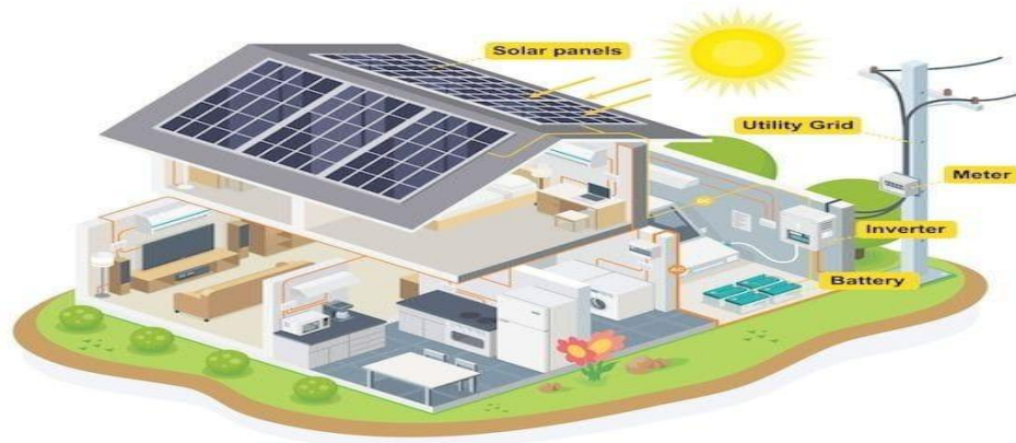
Figure 1. Home Solar Plant

trainer equipment, which is an important part of the PLTS implementation process.